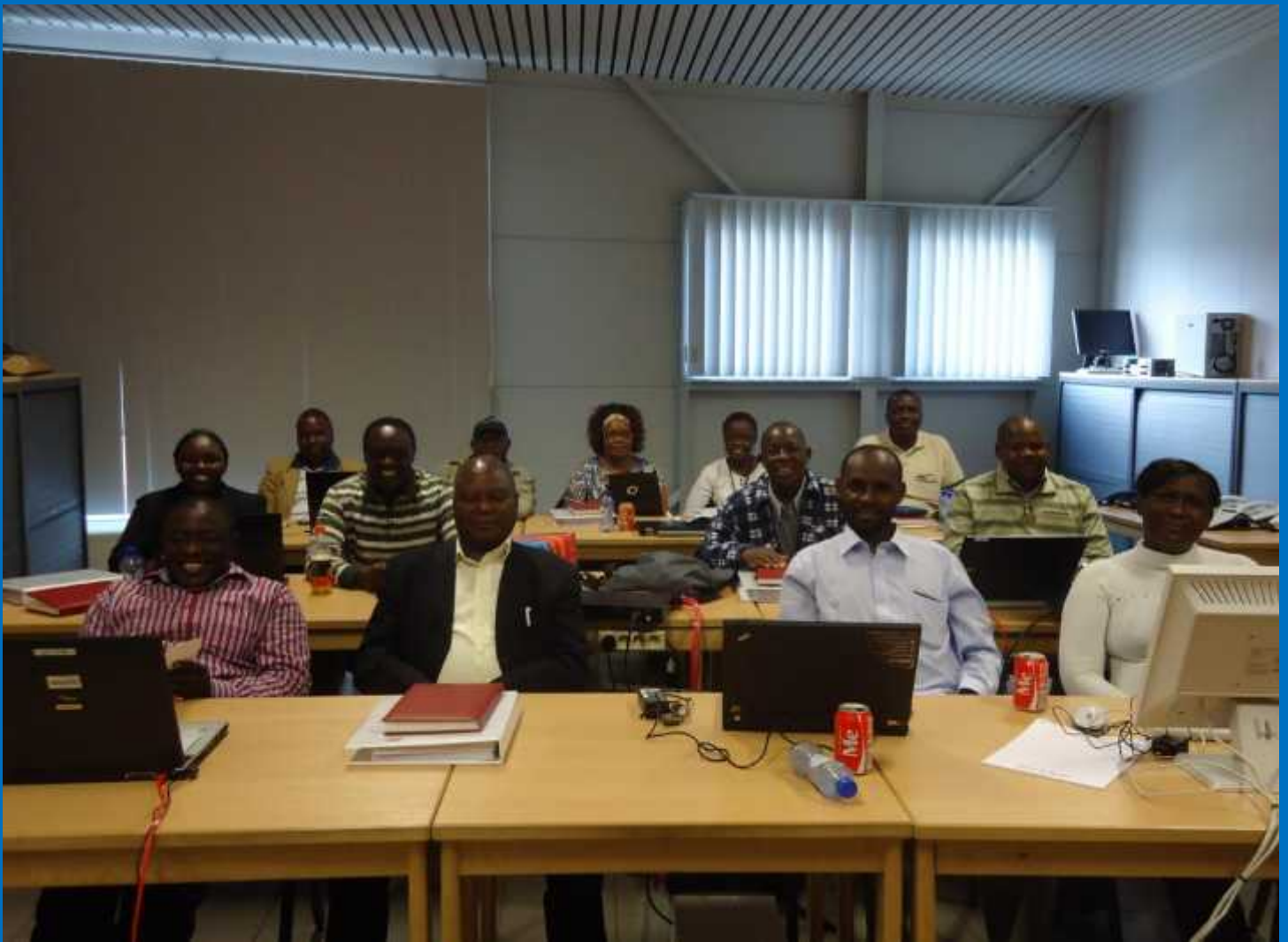
A team of representatives from the Ministries during the training in Belgium