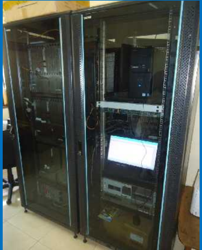
HiPath 4000 installed at the Ministry

New users continue to be added to the system which has a capacity to support up to 12,000 users.